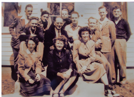
Bethany Fellowship Missionary Training Center began in 1948.